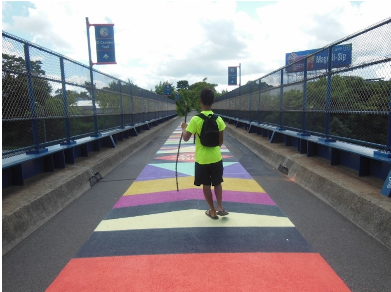
Bridge on the El Camino Trail

Rochester has been named a finalist for the National Civic League's All-America City Award, based on the strength of such projects as the High Blood Pressure Collaborative, Project HOPE and El Camino Neighborhood Revitalization and The Community Task Force of School Climate.