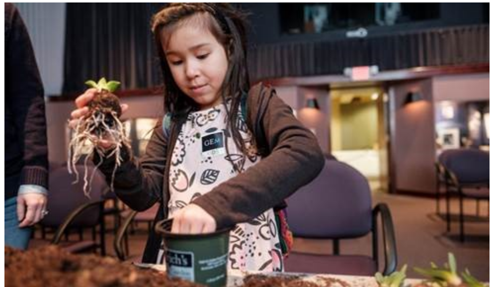
Saturday, February 29–Sunday, March 1, 2020, Second Floor Mansion George Eastman Museum 900 East Avenue