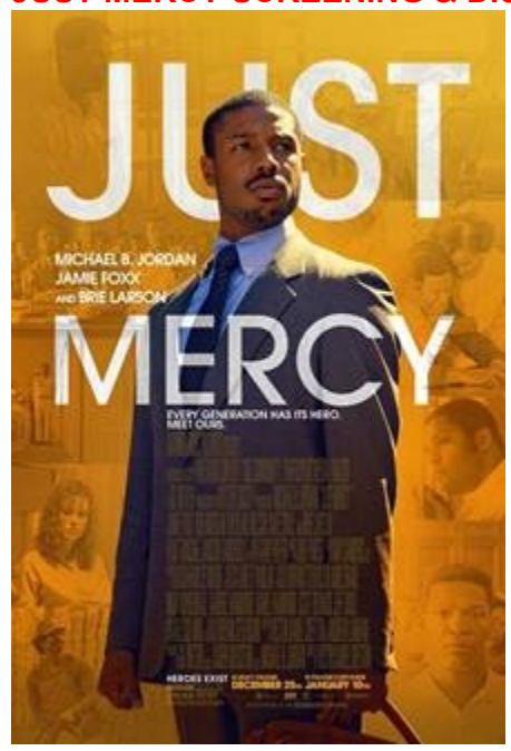
Sunday March 1 2:45 to 5:45

The Cinema Theater 757 Clinton Avenue S. Rochester, NY 14620