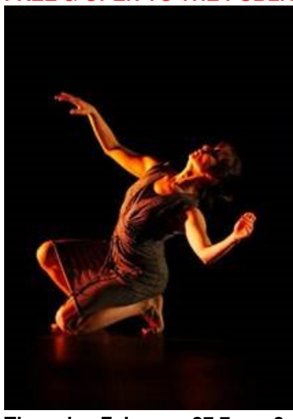
Thursday February 27 7 pm-8 pm Sunday March 1 2 pm Memorial Art Gallery 500 University Avenue