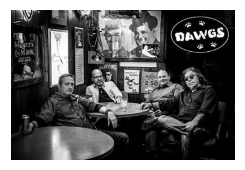
Thursday January 30, 2020 7 PM-10 PM Fairport Brewing 1044 University Avenue Rochester, New York 14607

Join us for an evening of great music and great drinks all to support Dimitri House. Bring a jar of sauce and a box of spaghetti and get $1 off your first drink! Featuring <a href="The Dawgs">The Dawgs</a> Rochester's only all Charity Fundraiser Band!! Generously supported by Rochester Neighborhood of the Arts Business Association (NOTABA)