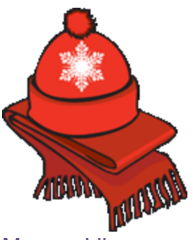
Monroe Library 809 Monroe Avenue Rochester, New York 14607

Monroe Library is in need of new or gently used scarves, hats and gloves for both children and adults. Look or ask for their winter basket.