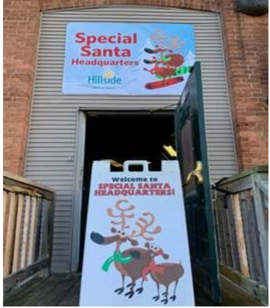
Saturday November 30 10 am-2pm Hillside Family of Agencies Special Santa Headquarters 410 Atlantic Avenue Rochester, NY 14609

While holiday shopping, swing by our SPECIAL SANTA OPEN HOUSE between 10 am and 2 pm on Saturday 11/30 to celebrate the season! Bring a new, unwrapped gift to make the holidays brighter for youth in our community. We look forward to seeing you at Special Santa Headquarters, 410 Atlantic Avenue, Rochester, NY 14609!