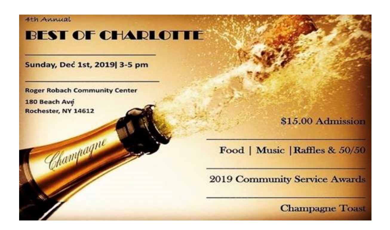
The 4th Annual Best of Charlotte